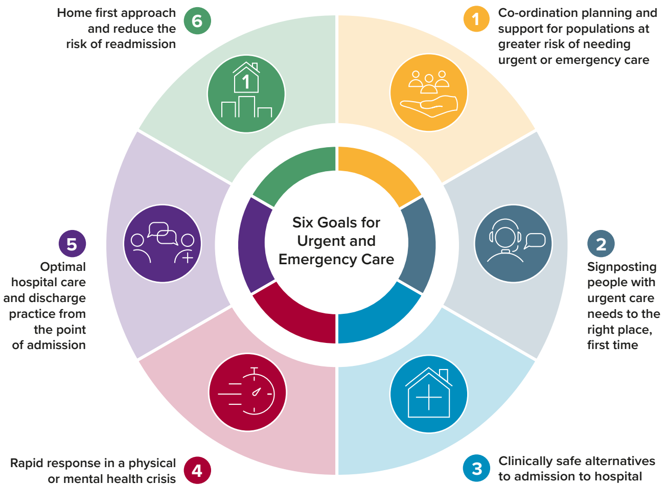
Illustration 1: the six goals for urgent and emergency care

It sets out our expectations for health, social care, independent and third sector partners for the delivery of the right care, in the right place, first time for physical and mental health. This will be achieved through consistent and integrated delivery of six goals for urgent and emergency care (Illustration 1) to help achieve the best possible clinical outcomes, value and experience for patients and staff involved in the delivery of care.